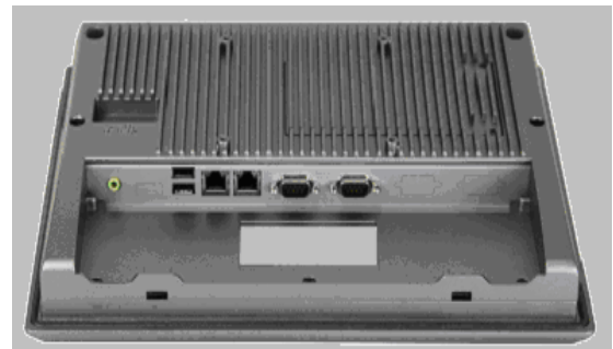
SSHC- and SSHI- 12x / 15x / 17x / 19X / 21x

Standard models are equipped with user selected operating system, a 16/32GB SSD, and a user selected Web Studio runtime softkey license ( optional USB hardkey can be ordered separately ). For options, such as Capacitive Touchscreen, more memory/storage, etc. contact SoftPLC Corp for ordering/pricing information.