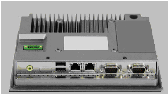
SSHC- and SSHI- 5x / 7x / 10x