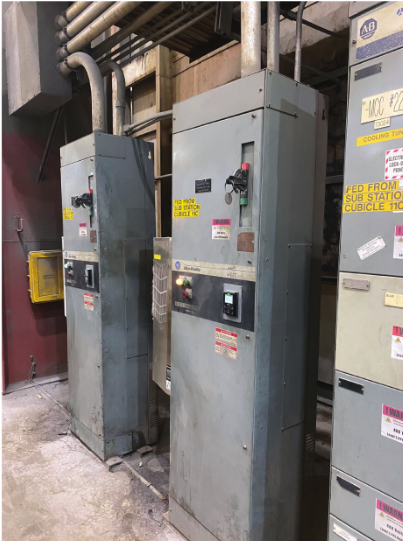
Right: Cooling tunnel fan cabinet with Siemens SINAMICS G120 drive and Power Module installed