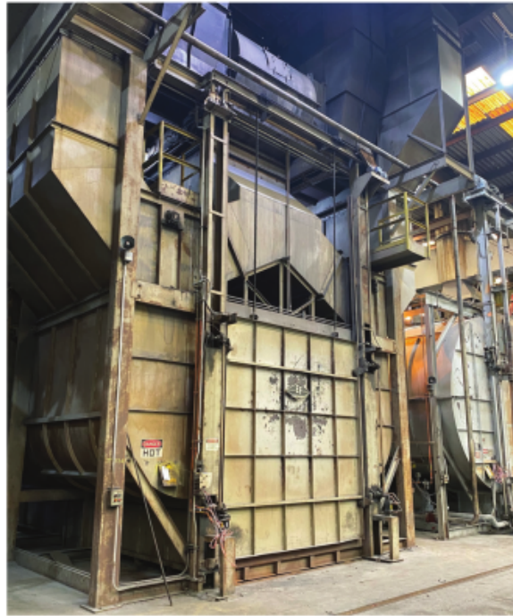
Forge, casting equipment, aluminum billets and cooling tunnel at Century Aluminum’s Mt. Holly, South Carolina plant

Published by Siemens Industry, Inc. 390 Kent Avenue Elk Grove Village, IL 60007 Order No. DRCS-CENTAL-0124 usa.siemens.com/motioncontrol