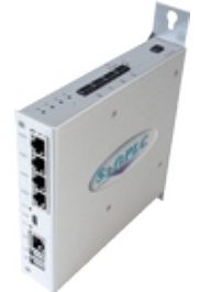
Smart SoftPLC w/ no local I/O interface + optional bracket