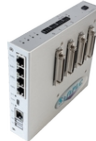
Smart SoftPLC w/ LocalPorts Interface