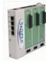
Smart SoftPLC w/ Backplane3 Interface (without and with modules installed)

The base Smart SoftPLC can be combined with different "daughter cards" for ultimate flexibility and expandability, tailoring the system to the application requirements, thus lowering cost and complexity.